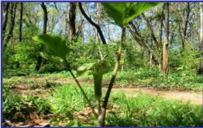
Jack in the Pulpit Along the Woodland Trail

It occurred to me as I was preparing a pictorial review of Friends of Old Annville activities for 2009, that events associated with the Quittie Creek Nature Park have come to comprise an important part of our annual activities. When the Quittie Creek Park Committee joined with Friends of Old Annville in the very early 1990's, I wondered if it would be a good fit - one group interested in historic preservation and the other in preservation of a natural area. Now, almost 20 years later, I'm convinced that there is a strong, inherent synergy between the two organizations and in what they each are trying to accomplish.