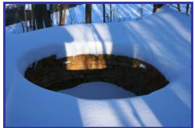
A Lime Kiln in Winter