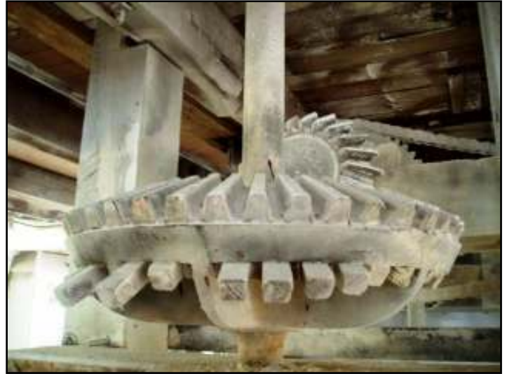
Photos of the Flouring Mill interior